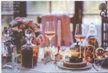
Some of the raw material for the restaurant is grown in-house