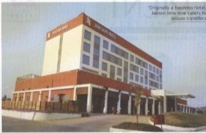
Originally a business hotel, Jackson Inns now caters to leisure travellers