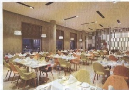
The Puzosgaon windmill site (left) and the spacious restaurant at the hotel